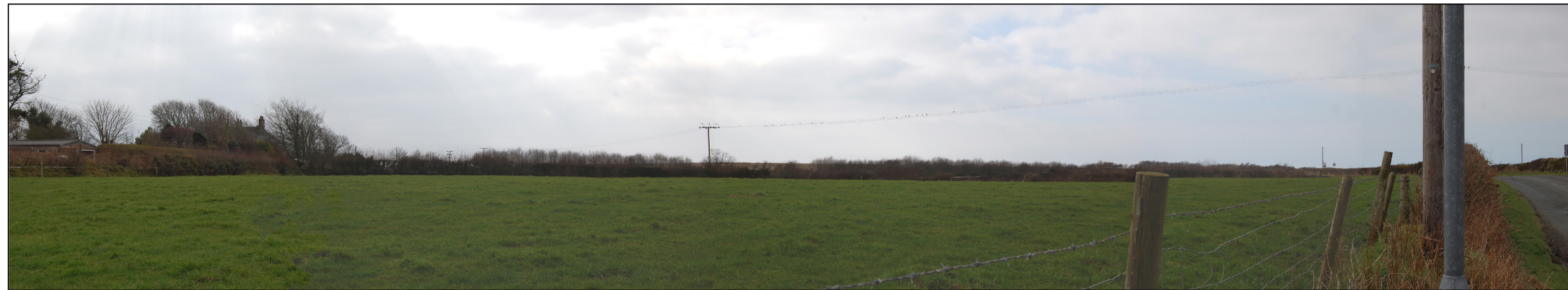
VIEWPOINT 14 - STUBBLE GREEN - EXISTING