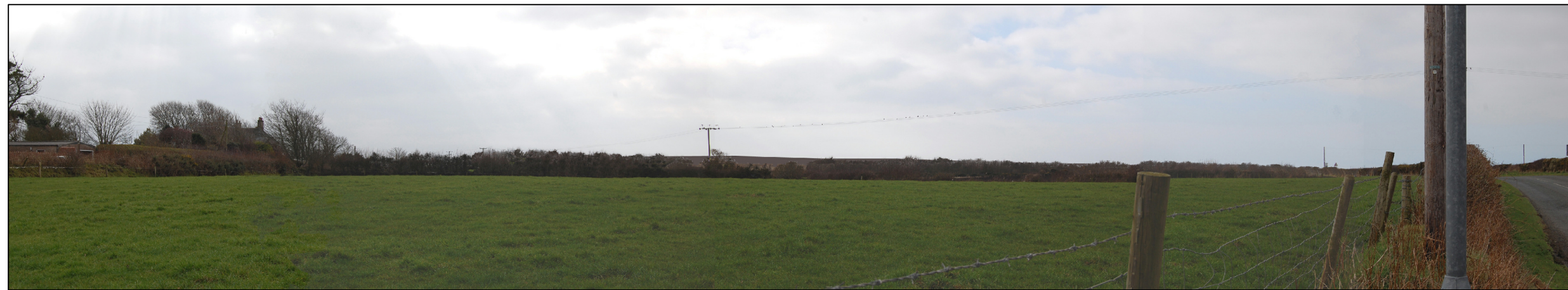
VIEWPOINT 14 - STUBBLE GREEN - WITH PROPOSED LANDFORM