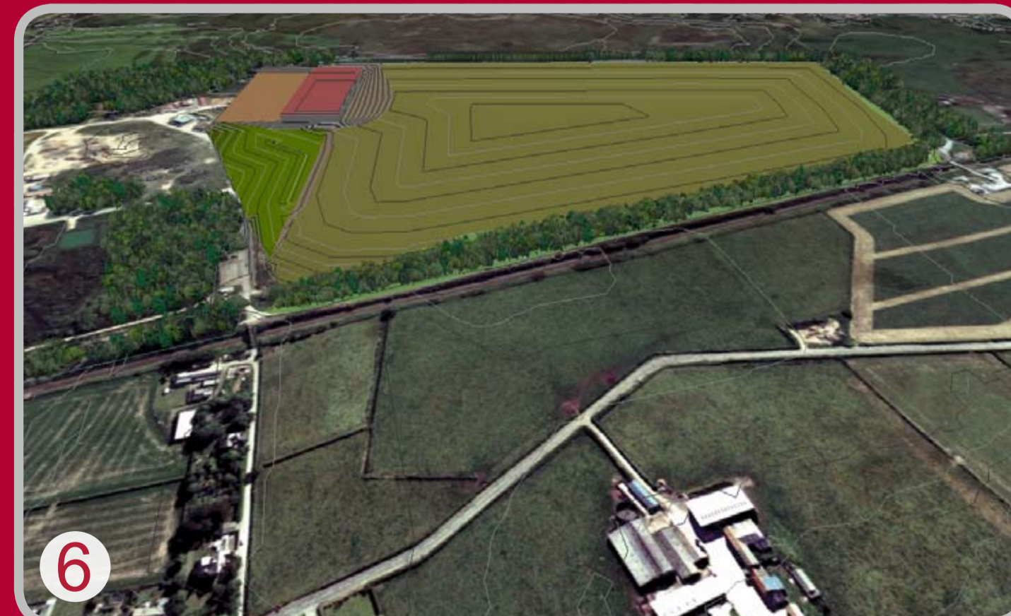
6 Capping Vault 12 and adjacent Trenches