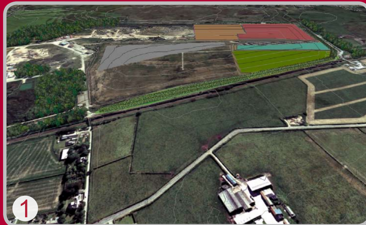
1 Site preparation

Phase 8 (2078 - 2079): Work within this phase is limited to the importation of capping and profiling materials and the capping of Vault 14 and the adjacent trenches. It represents the final phase of capping, with the landscaped cap in its final form.