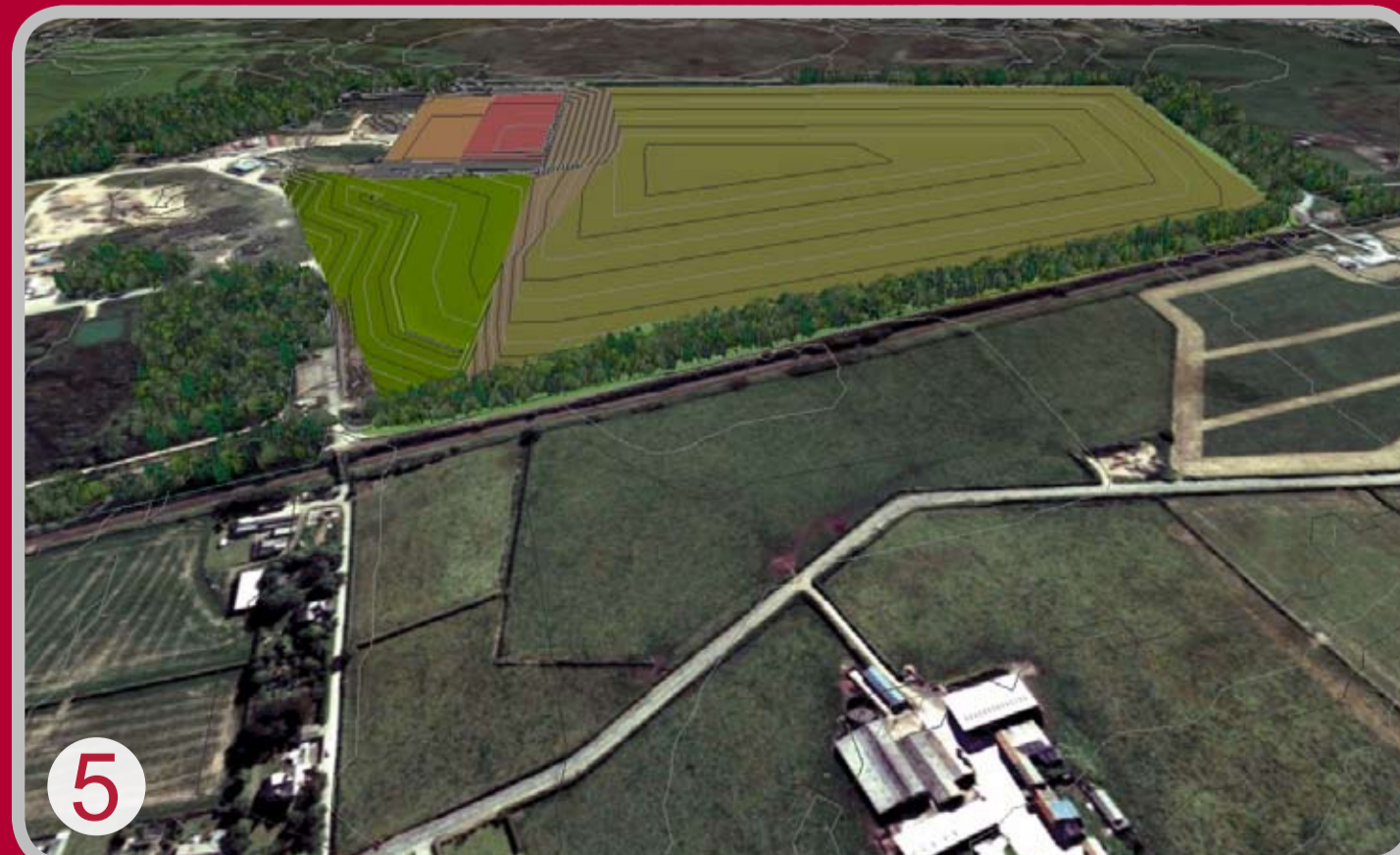
5 Capping Vault 11 and adjacent Trenches, construct Vault 13