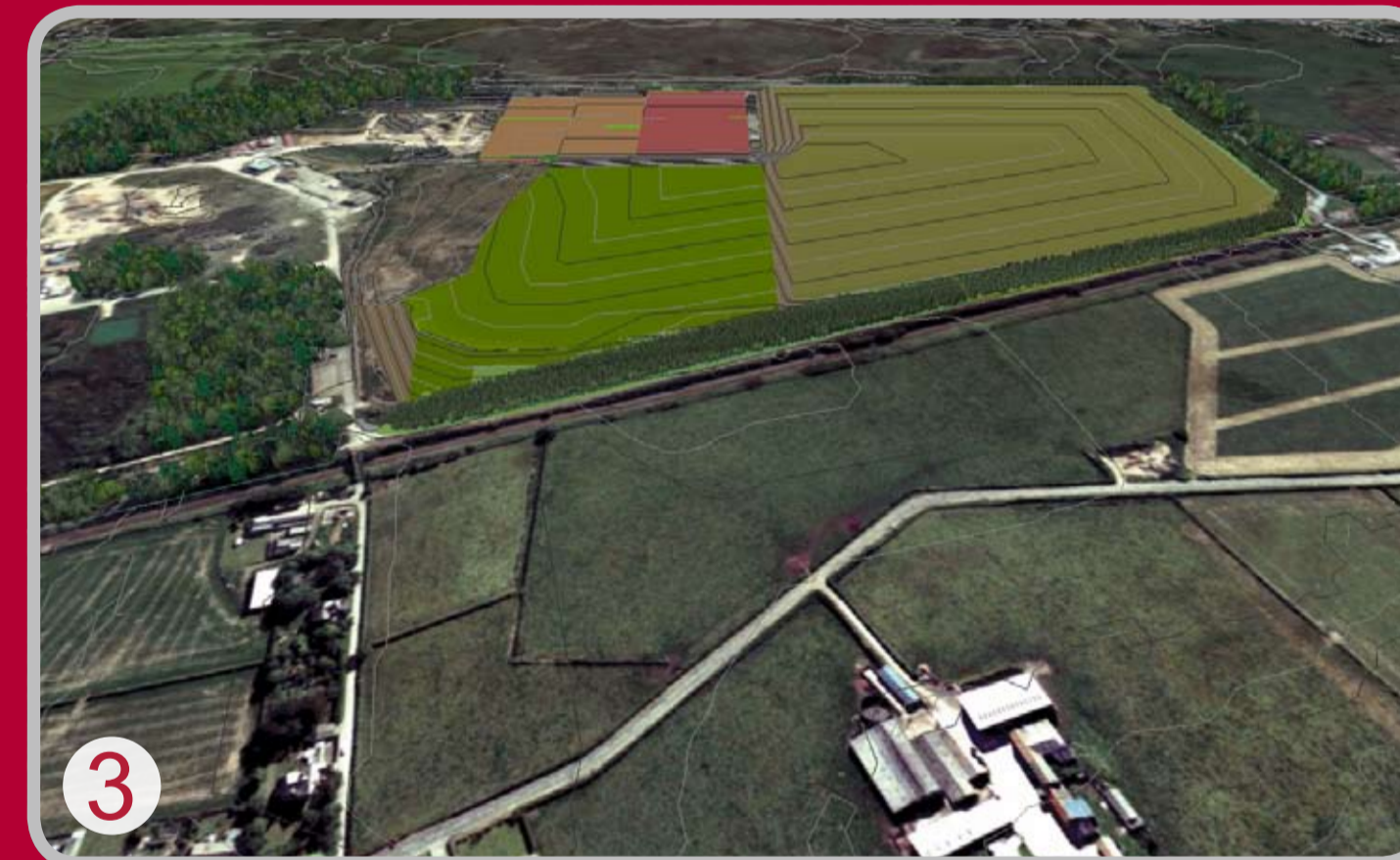
3 Capping Vault 9 and adjacent Trenches, construct Vault 11