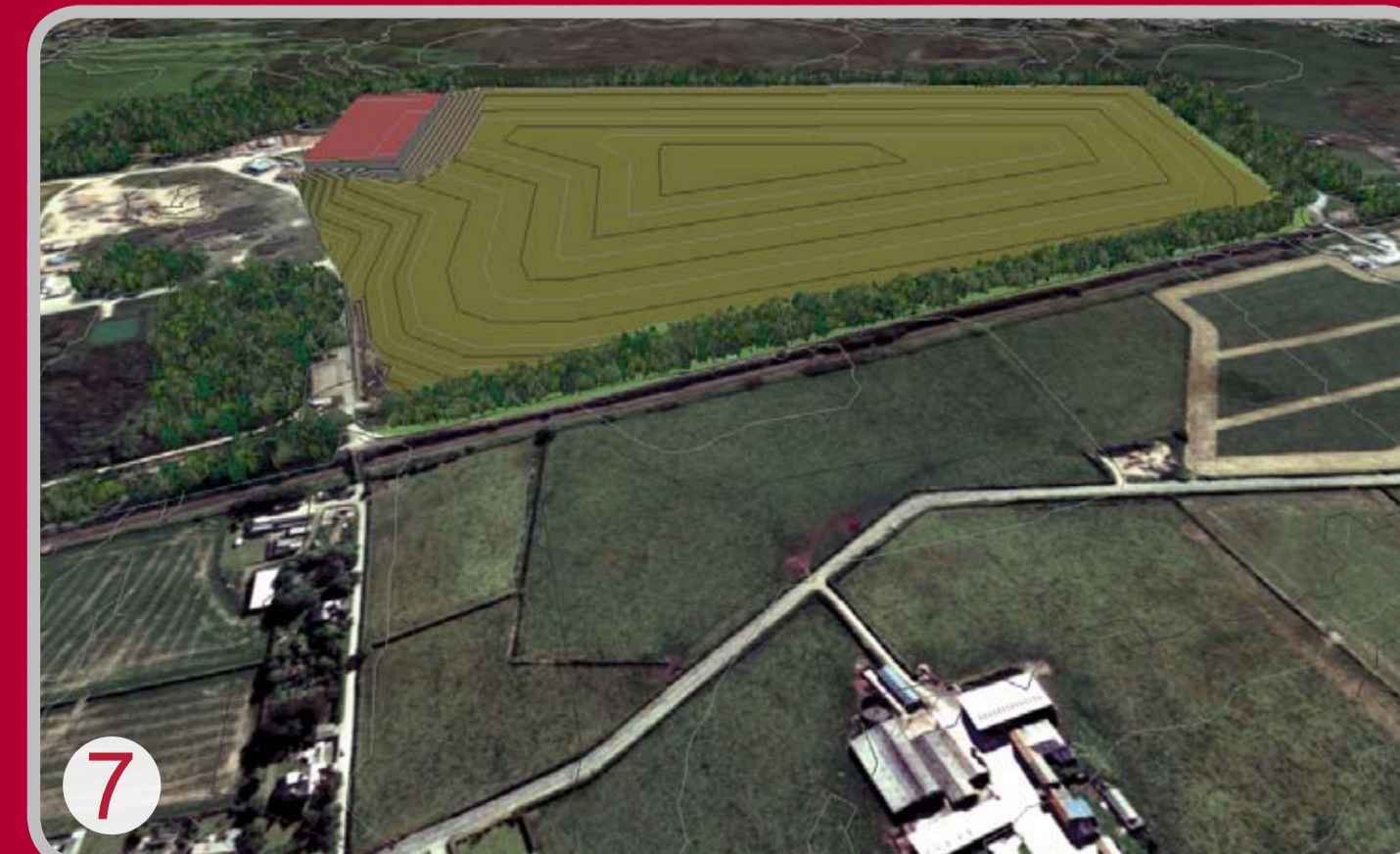
7 Capping Vault 13 and adjacent Trenches, construct Vault 14