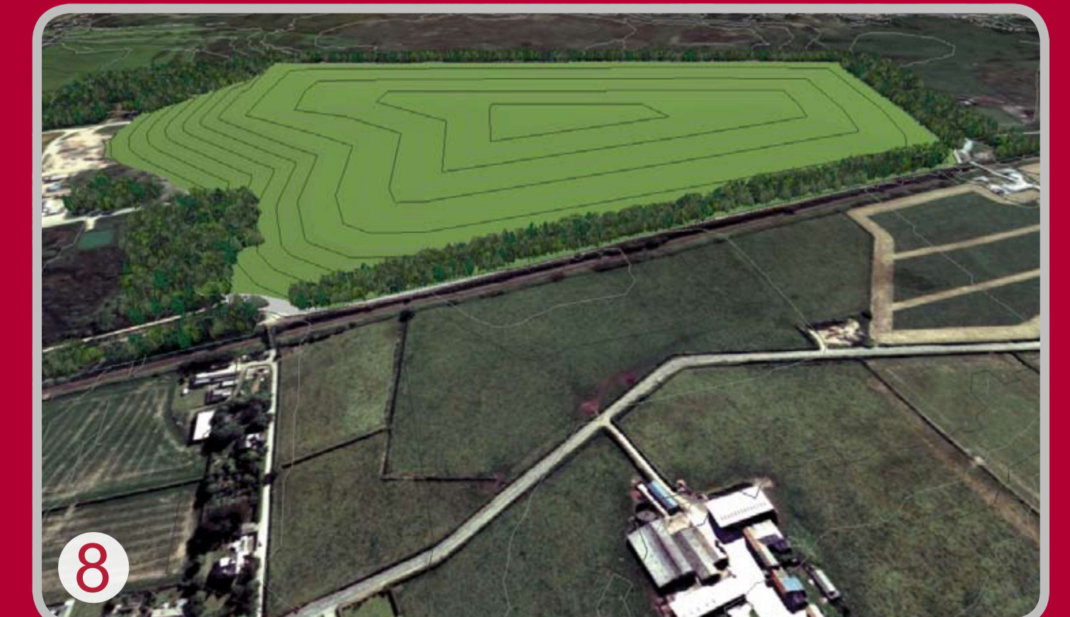
8 Capping Vault 14 and adjacent Trenches