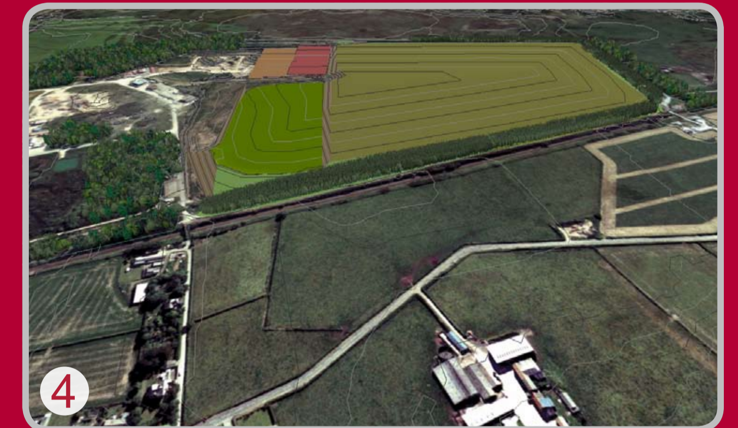
4 Capping Vault 10 and adjacent Trenches, construct Vault 12